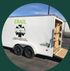
ERAIL RESPONSE TRAILER DEMONSTRATION