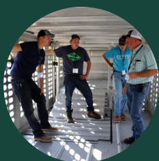
LIVESTOCK TRAILER DESIGN