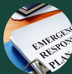
EMERGENCY RESPONSE PLANS