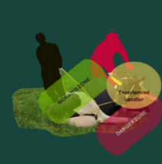
HANDLING COMPROMISED ANIMALS