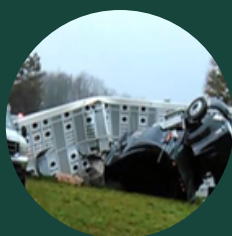
ROLLOVER ACCIDENT FACTORS