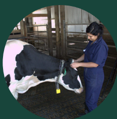
ANIMAL HANDLING & BEHAVIOR

THE ONE-DAY TRAINING WILL COVER VARIOUS ASPECTS REQUIRED FOR AN EFFECTIVE RESPONSE TO LIVESTOCK ACCIDENTS. THIS ENCOMPASSES MANAGING THE ACCIDENT SCENE, COORDINATING VOLUNTEERS, AND ENSURING THE WELL-BEING OF BOTH HUMANS AND ANIMALS, AS WELL AS MAINTAINING PUBLIC SAFETY.